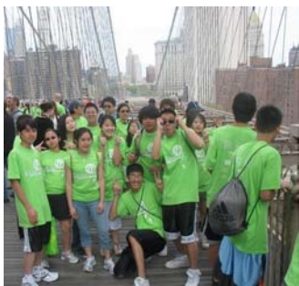
A picture of the walk-a-thon participants posing on the Brooklyn Bridge!